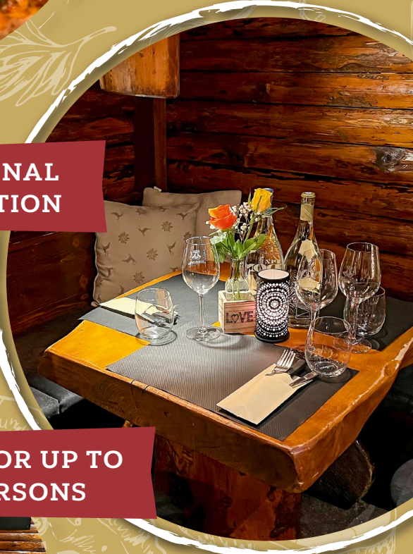
ROOM FOR UP TO 70 PERSONS