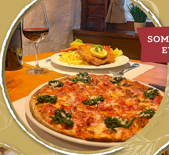
SOMETHING FOR EVERYONE