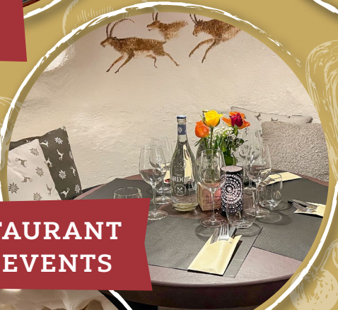
PIZZERIA RESTAURANT FOR VARIOUS EVENTS